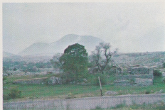
Picture of countryside without Mini.