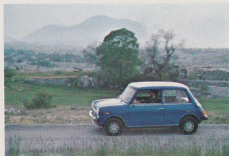
Picture of countryside with Mini. (Notice how Mini's smart styling improves the landscape!)

A Mini seats four normal adults (or three linebackers) with comfort. Yet it steals in and out of tiny parking spaces too small for lesser (that is, bigger) cars.